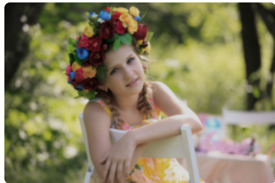
Blurry or dim vision