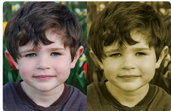
Left, normal vision. At right, dull or yellow vision.