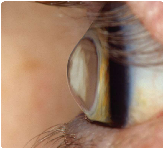
An eye with keratoconus, where the cornea bulges out like a cone.

Your cornea is the clear, dome-shaped window at the front of your eye. It focuses light into your eye. Keratoconus is when the cornea thins out and bulges like a cone. Changing the shape of the cornea brings light rays out of focus. As a result, your vision is blurry and distorted, making daily tasks like reading or driving difficult.