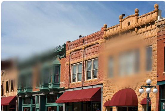
A normal visual field is represented in the top image on the top. The bottom image is an example of early to moderate visual field damage.